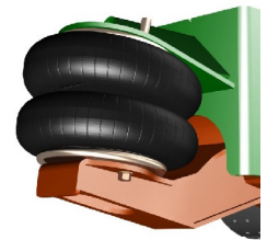
Integrated Front Lift Kit